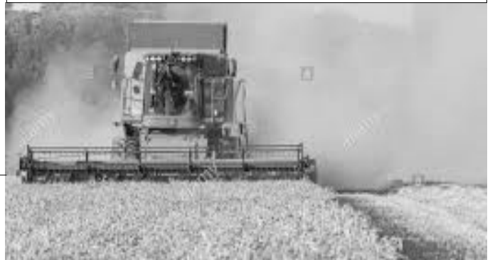
Below: Harvesting in dry and dusty conditions.

Harvest will be celebrated at our churches as follows: