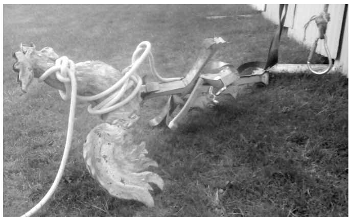
Above: The cockerel made a safe if slightly undignified descent from the tower of All Saints.

The cockerel apparently was unique. Repair would be slow and costly, and we would have to pay large hire charges to keep the scaffolding in place - none of this covered by insurance. It was therefore reluctantly decided to have it taken down for safety reasons and also to protect church funds. The lightning conductor system has since been repaired and upgraded and the cockerel was left 'resting' in the choir vestry. All is not lost though! The congregation has decided to have it partially renovated and mounted onto a plinth and hopefully it will be on display inside the church in the near future.