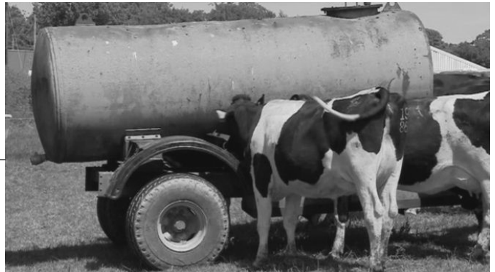
Above: Emergency water supplies are brought in for the cows in the fields.