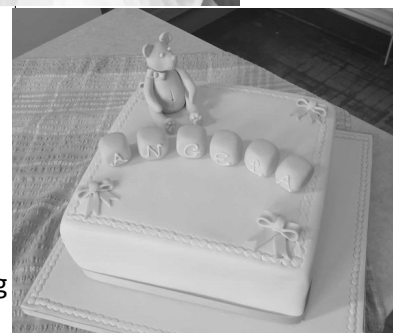
A special christening cake for Angela.