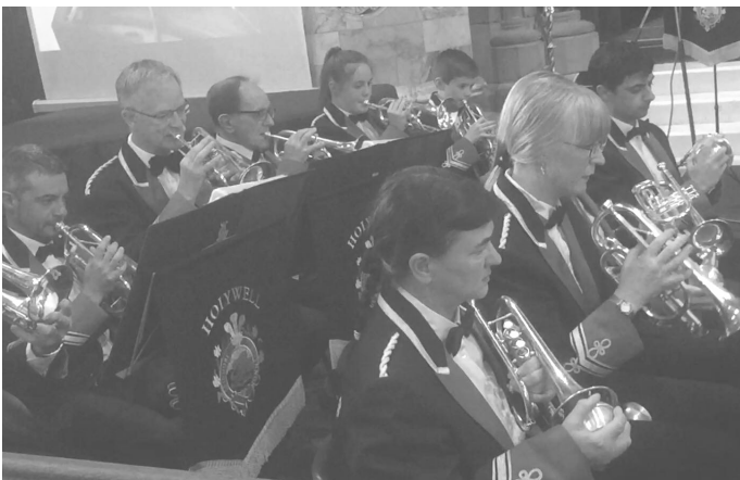
Above: Holywell Band's summer season at St Paul's continues. The monthly brass concerts have now raised over £1,000 to support the young choral scholars in the church choir, and to pay for lessons for young players in the band. Next concert 1st September .