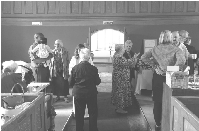
Above: Coffee and chat at St Cystennin's after the joint service with St Katherine's on 29th July. The next joint service is on Sunday 30th September at 10.30 am at St Katherine's/

In her sermon about the Feeding of the Five Thousand we were reminded how often, with so little, God can do so much. She encouraged us to offer the individual gifts we have been given, to God, no matter how small. In our small church we all do "muck in" and all have a role to play...but are we using all the gifts we have been given? Please pray that we all use our gifts no matter how small or inadequate they feel.