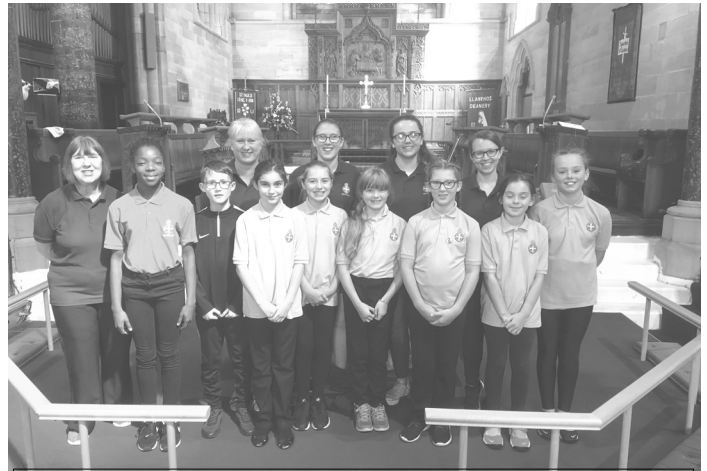
Above: Members of the 26th Liverpool Girls Brigade returned to St Paul's in August for their annual summer camp, and joined the congregation for the 9.45 am Sunday service, doing the readings and having a tour of the church afterwards.

Please remember the Food Bank when you are doing your weekly shop - there are boxes for donations in all our churches.