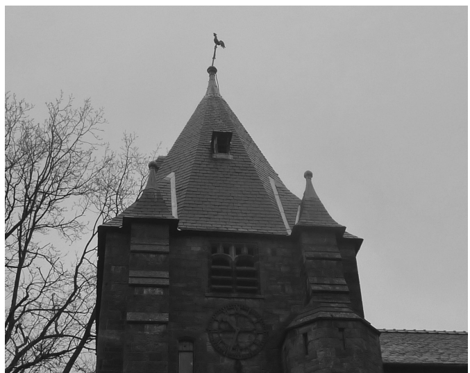
Above: The tower of All Saints Church, Deganwye, showing the cockerel weathervane before its recent descent - see story on page 11.

The Church will be open from 10.30 am to 3.30 pm, Copies of church records - baptisms, weddings, burials - will be on display. (The church has a toilet and a kitchen for refreshments.) Come and visit this lovely church, once a local landmark but now almost hidden by recent building developments.